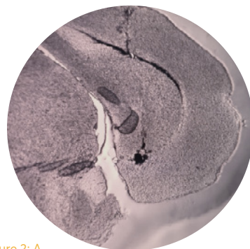
Figure 2: A

Figure 2: A: Verification of injection site by ink injection into the entorhinal cortex and B: Tau expression in the ERC after P301L Tau virus injection.